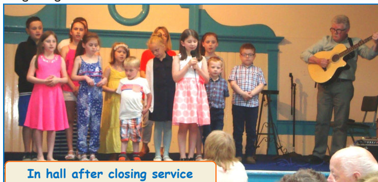
In hall after closing service

Once again it's the start of a new session. By the time you read this the staff will have had a meeting and we will have a full calendar ready for the Sunday School's return. We start back on August 20th. I'm sure any of you who went along to Summer Sunday school had great fun. This year we will again be using Scripture Union materials which we find bright and colourful, just as the children are used to at school. We will be having our usual fundraiser in November. The presents from the Gift Service, also in November, will be distributed to local charities. Our Nativity is one that we have done before. A few of the children had asked if we could perform this one again. After all we are an Eco Church, so how could I refuse a bit of recycling. We look forward to seeing you all on the 20th August. If you haven't been for a while, come back and see us soon. Any questions regarding the Sunday school or Tots and Toddlers please speak to me or a member of staff. New Session, New Beginnings.