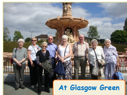
At Glasgow Green