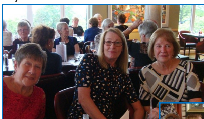
Dinner at Highgrove House Hotel

At the close of last session, in addition to the donations to 'Scottish Care & Information on Miscarriage' and Macmillan mentioned in previous magazines we were also able to make the following donations – Church £250, Flower Fund £150 and Wynd Centre £100.