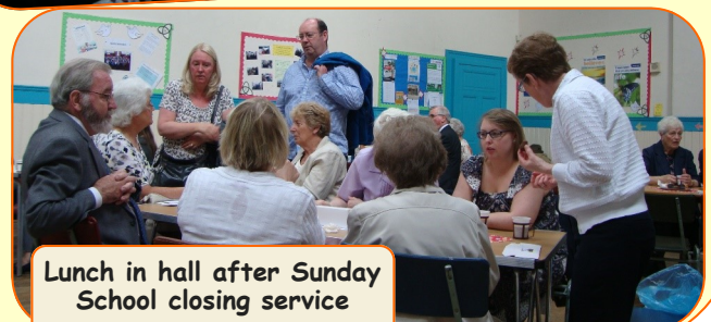
Lunch in hall after Sunday School closing service